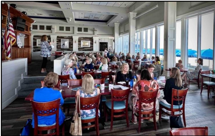
Members and Guests