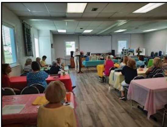
" New and Potential Members Listening Intently"