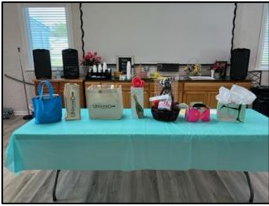
"Rewards for Paying Attention"

The Member to Member Committee was delighted to host the club's New Member Orientation on April 13. Ten members inducted during the 2022-23 year, four members from the 2021-22 year and three potential members joined us to learn more about our club and all of the committees available to serve on. Each committee chair was given a few minutes to talk about their committee, its responsibilities and timeframe for service. These presentations were followed by a delicious light dinner prepared by members of the Member to Member Committee. A special THANKS to all that prepared the food and brought the paper goods! Then the new members were quizzed with some trivia questions to see how much they learned about our committees.