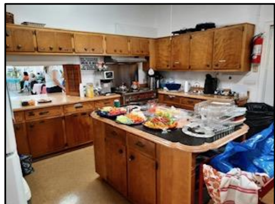
"Food is Good for the Brain "